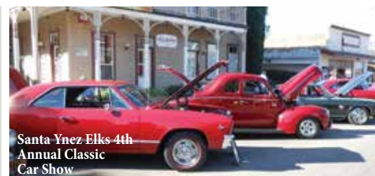
Santa Ynez Elks 4th Annual Classic Car Show