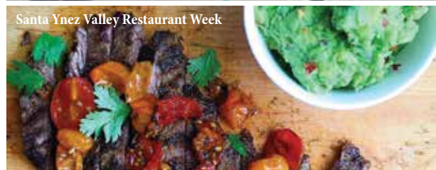
Santa Ynez Valley Restaurant Week