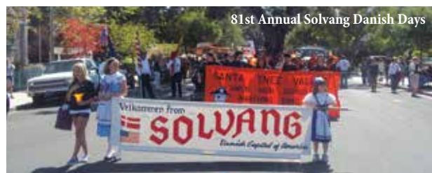
81st Annual Solvang Danish Days

19: Buellton Wine and Chili Festival: A chili cook-off, salsa competition and wine