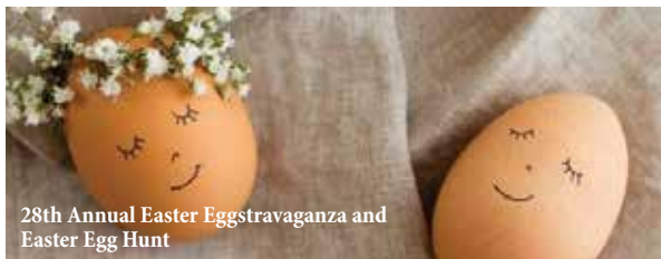
28th Annual Easter Eggstravaganza and Easter Egg Hunt