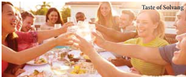
Taste of Solvang

6-9: Celebration of Harvest Weekend & Festival Grand Tasting: Presented by the Santa Barbara Vintners this four day wine and food celebration includes