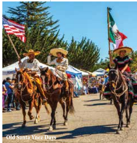
Old Santa Ynez Days