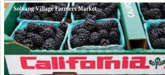
Solvang Village Farmers Market

tasting event with live music and beer. Flying Flags RV Resort and Campground, 805.688.7829, BuelltonWineandChiliFestival.com